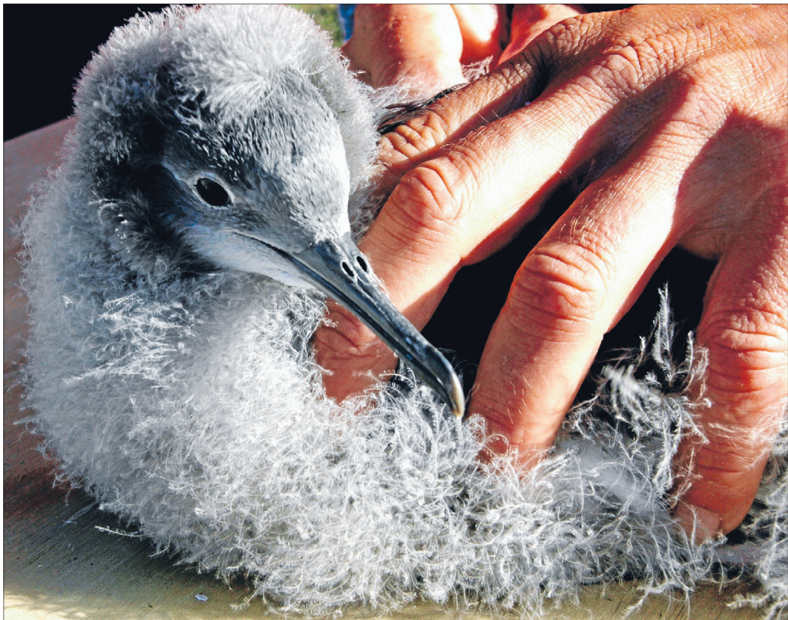
Good-looking chick: A hutton's shearwater at the Kaikoura Peninsula colony gets ready to be fed.

"There must have been a krill explosion because they're all nice