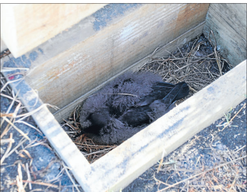
Quiet time: A hutton's shearwater is placed into a man-made burrow on the Kaikoura Peninsula colony.